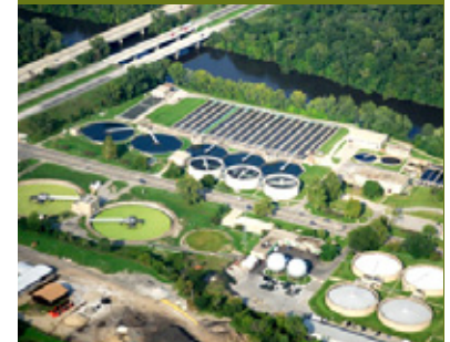
Preventing and Reducing Pollution