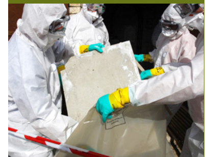
Mitigation or Cleanup of Pollution